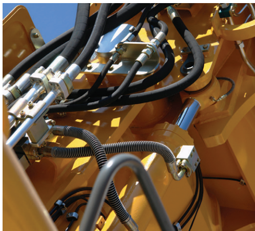
Adding oil additives to hydraulic installations can quickly achieve major savings.

The test oil is evaluated in-between the two baseline runs. The test oil is initially aged during 16 hours of engine operation at 2,250 r/min and 120 C oil tempera-